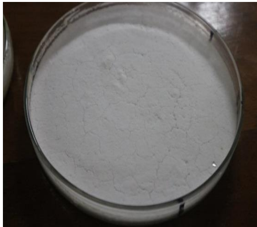
Picture 1. Polyethylene microplastic from the dried scrub soap

The microplastic used was a type of polyethylene derived from the shieving of scrub soap. The scrub was dissolved in water, then filtered using filter size 0.075, 0.125, and 0.180 mm arranged in sequence with the lowest size at the bottom. The results were transferred into a petri dish to be heated in an oven at 90°C for 48 hours (Figure 1).